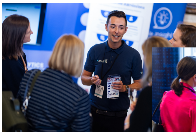
Exhibitors engaging with the delegates at the IHE Annual Conference 2024.

Make the most of networking at the IHE Annual Conference 2025 with a stand in our exhibition area where delegates will congregate at registration, lunch, and during each break for refreshments. An exhibition stand is a great way to increase brand awareness and communicate your message to IHE Members.