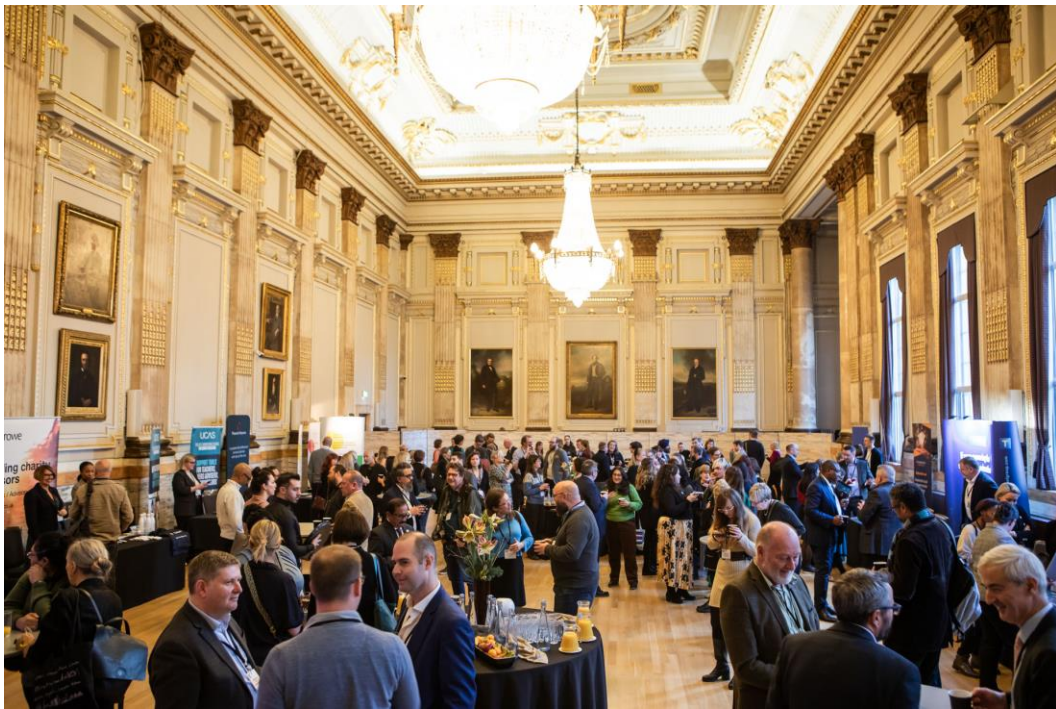
Exhibition and refreshments, in the Great Hall, IHE Annual Conference 2023

Make the most of networking at the 2024 IHE Annual Conference with a stand in our exhibition area in the Great Hall, where delegates will congregate at registration, lunch, and during each break for refreshments. An exhibition stand is a great way to increase brand awareness and communicate your message to IHE members.