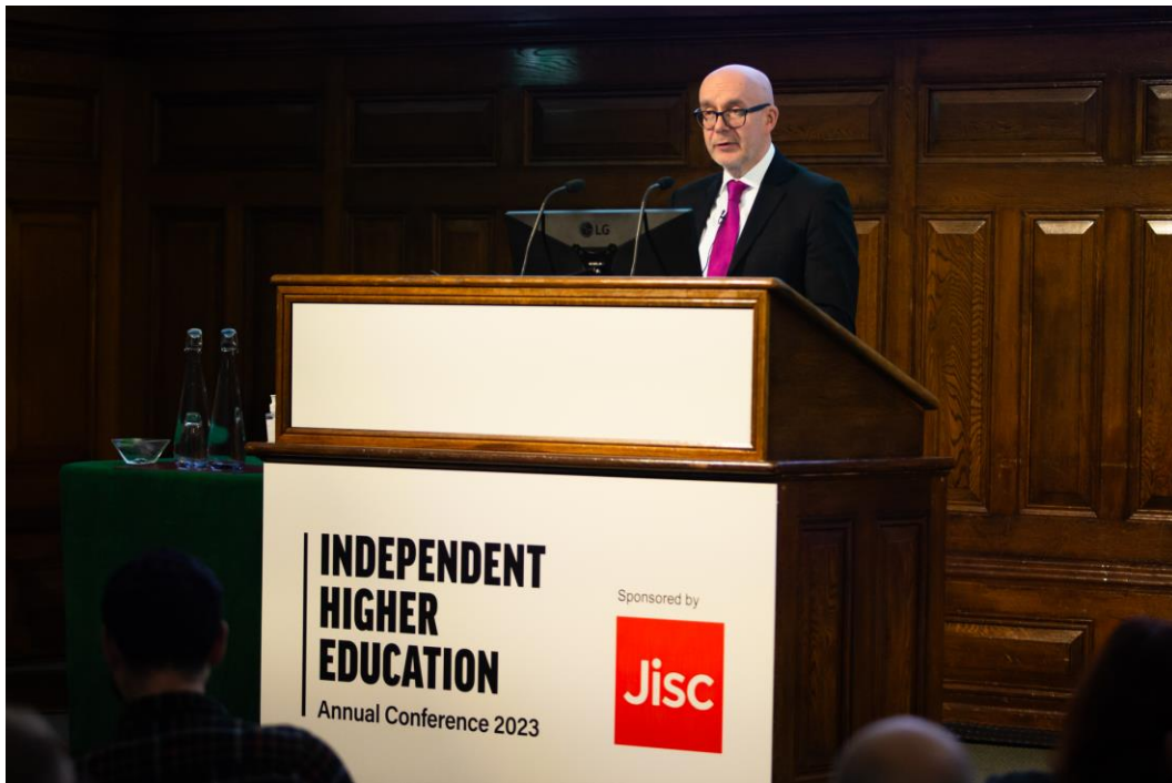
Lectern branding in main lecture theatre, IHE Annual Conference 2023

There is only one opportunity to be the 2024 IHE Annual Conference Platinum Sponsor, which is the package that will provide you with maximum exposure.