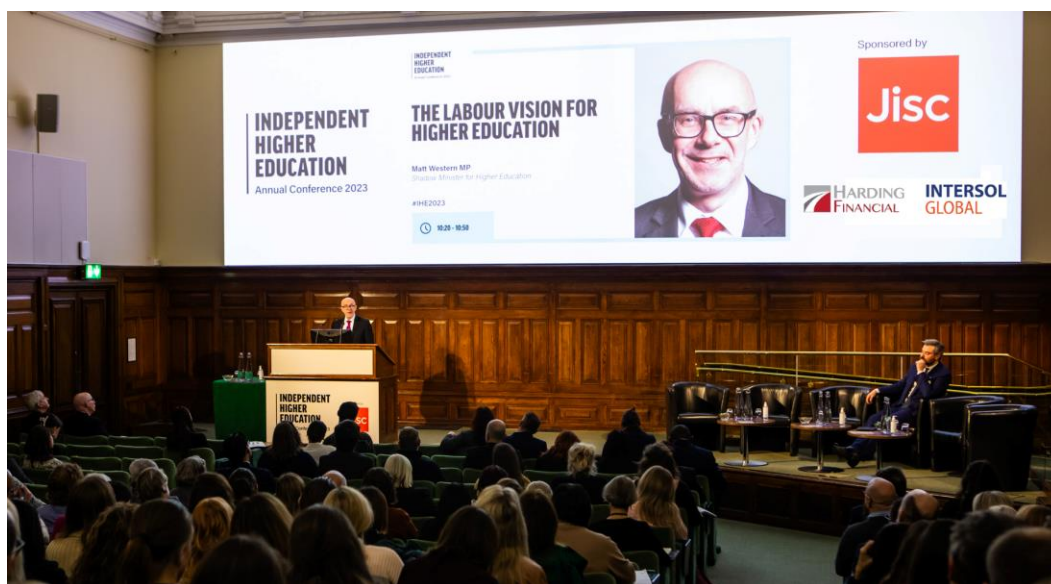
Proposed projection in main conference lecture theatre, logos for illustration purposes only

There are only two opportunities to be a 2024 IHE Annual Conference Gold Sponsor, providing exposure at key touch points.